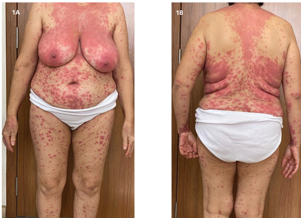
Figure 1A, 1B. Widespread pustular lesions and erythematous plaques on the trunk