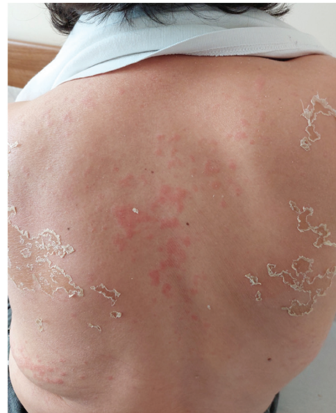
Figure 3. The erythematous eruption and pustules were resolved, followed by desquamation

There is no specific method for the treatment of AGEF. The most critical step is the elimination of the agent, the illness should respond in a few days. AGEF is generally self-limited and has a favorable prognosis. However, sometimes it can be severe enough to require hospitalization. Death was reported in a case of AGEF due to HCQ use. Except for drug discontinuation, topical corticosteroids benefit patients with itching and inflammation. [1] In severe or