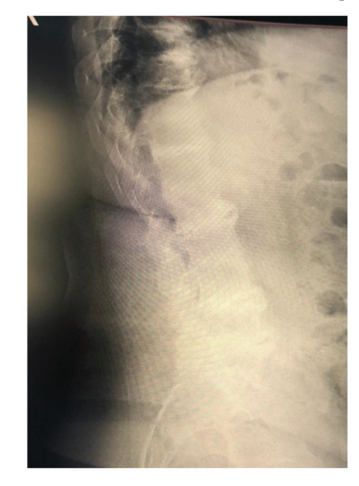
Figure 4. Lumbar vertebrae radiography

On magnetic resonance imaging of the sacroiliac joints, hyperintense lesions were observed in Cor STIR series on both the sacral and iliac surfaces, which may be compatible with sacroiliitis (Figure 7). Ochronotic arthropathy and