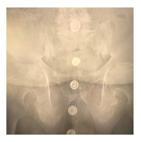
Figure 6. Sacroiliac joint radiography, 361x360 mm (72x72 DPI)

Ochronotic arthropathy is frequently overlooked. Diseases such as hyperparathyroidism, ankylosing spondylitis,