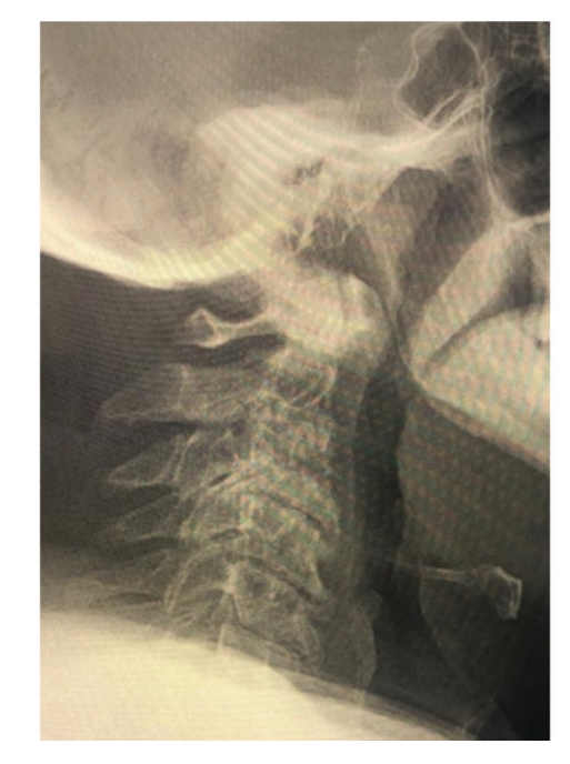
Figure 5. Cervical vertebra radiography