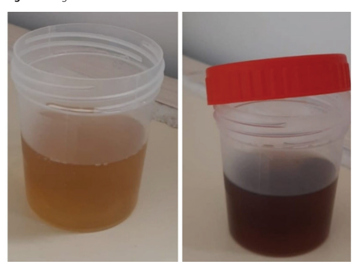
Figure 3. Black urine

degenerative changes on the anterior vertebrae, and marginal subchondral sclerosis on cervical vertebra radiographs (Figure 5). On the sacroiliac joint graphy, severe narrowing, irregularity, and erosions were detected in the bilateral coxofemoral areas, especially on the right, which might suggest grade 3 sacroiliitis (Figure 6).